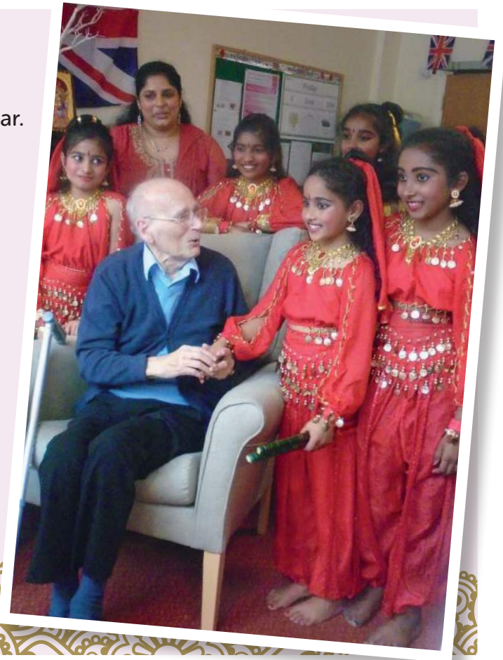
We were captivated by the girls' stunning costumes and dance moves

The day didn't finish when the dancing was over however and the residents enjoyed the Taste of India and sampled a selection of foods - from Tandoori Aloo Samosas to Masala bites, onion Bhajis and vegetable Samosas.